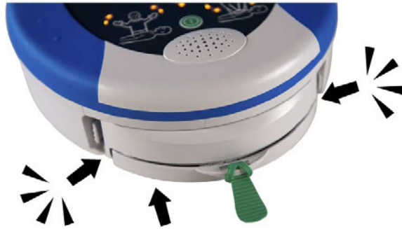
Figure 3 – Inserting a Pad-Pak