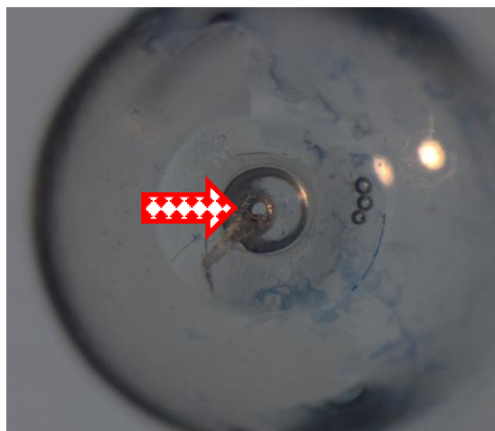
Figure 3: Example of a damaged AssayCup with the small hole at the bottom, which can only be seen with magnifying glasses. The small hole is marked by the red arrow. Blue colored water and the three water droplets next to the small hole are the result from previous investigations.

It cannot be excluded, that incorrect results may have occurred due to the damaged AssayCups.