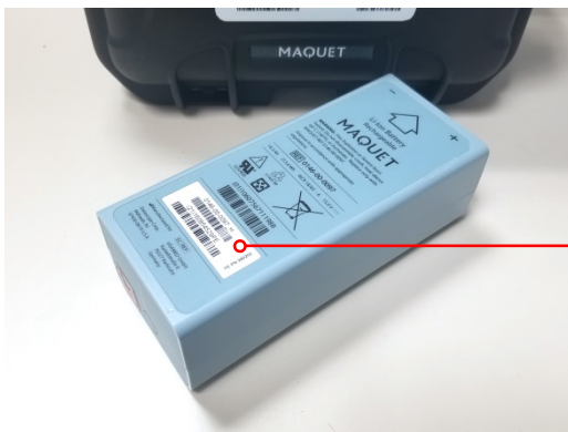
Barcode Label Placement

A white barcode label is affixed to the top of each Cardiosave Lithium-ion Battery Pack. This barcode label provides information such as part number, serial number, and year and week of manufacture. Refer to the example below for barcode label placement.