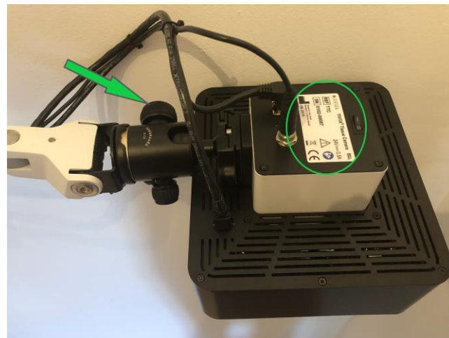
Figure 2: the green arrow marks the screw that loosens the ball head for adjusting the position of the TIVITA Camera; the green circle marks the label where you can find the serial number

Please fill out the form of confirmation for the receipt and the execution of actions and send it to one of the reference persons.