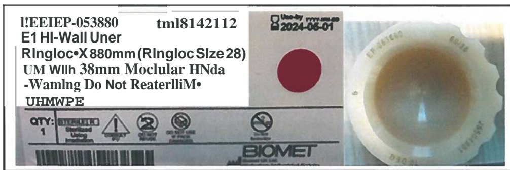
EP-053660 Ringloc-X E1 HiWall Lot number 6542112 contains EP-063660 (Ringlox-X E110 Deegree ) Lot J6504901

Biomet UK Ltd. is conducting a medical device Field Safety Corrective Action (removal) for specific lots of Ringloc Acetabular liners indicated in the table above due to the implants not matching the packaging label.