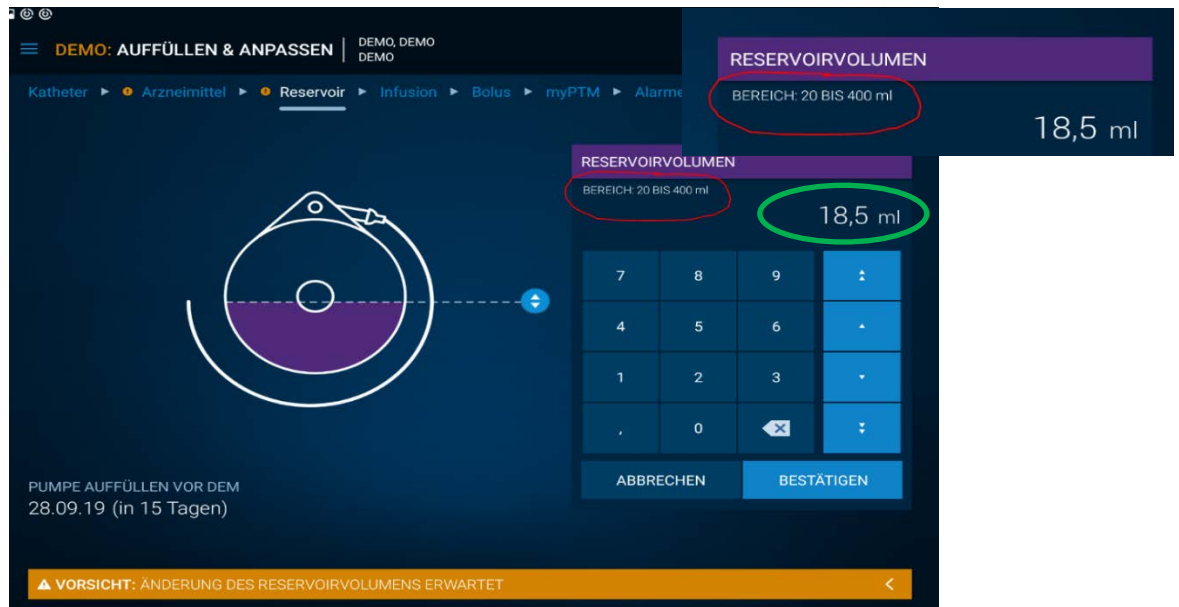
Figure 1: Incorrect values displayed for the allowed range of the reservoir volume (200 – 400 ml): Data entered by HCP is correct (18.5 ml)