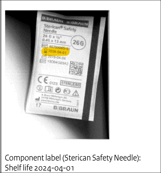
Component label (Sterican Safety Needle): Shelf life 2024-04-01