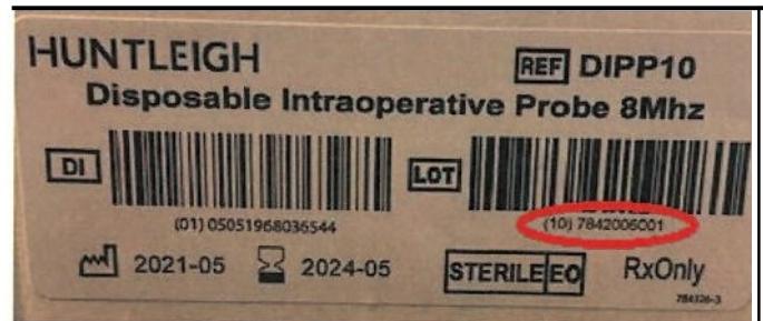
DIPP10 Box Label

Distribution Date: 30 th Sept 2021 to 31 st January 2022